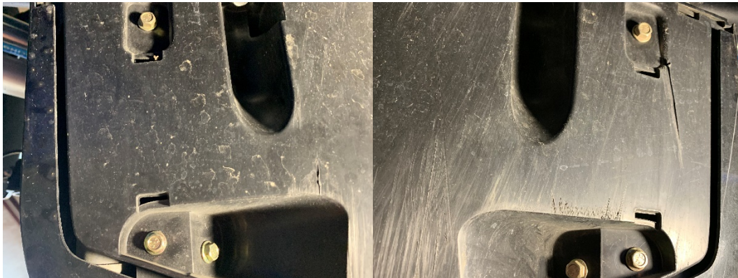
Underside view of a typical F3

1.- Installing the new Grille Guard is simple. Only four bolts! First remove the LOWER 4 factory 6mm bolts as shown below. These are the two outside bolts each side.