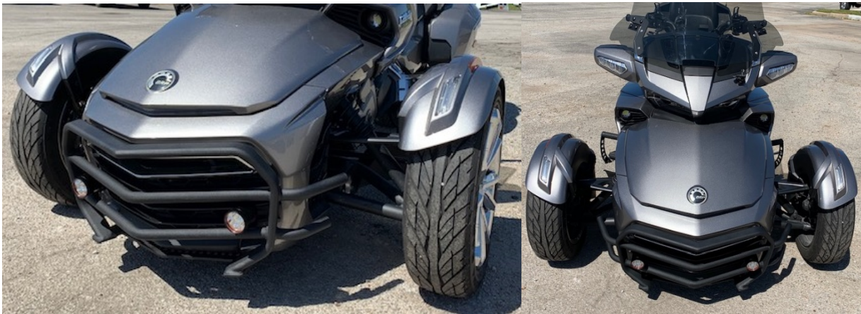
Shown with Optional Driving Lights

4.- The slots allow for alignment of the center Grille Guard with the F3 center Grille. Once placed in location tighten bolts.